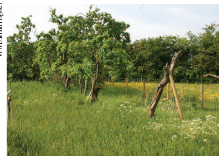
2 Manning AD, Fischer J & Lindenmayer DB (2006). Scattered trees are keystone structures – implications for conservation. Biological Conservation 132: 311-321

The minimum amount of space required by a tree or shrub to grow to its full crown height and spread – especially the development of the lower branches – depends on the species (and genetics) and also on its situation. Provide each tree with an area that is at least as wide in radius as the expected height of the tree (see chart on p 5) e.g. Scots pine has a top height of 40m and is very light demanding, so should be planted at 40m centres.