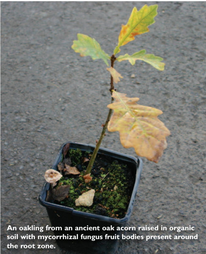
An oakling from an ancient oak acorn raised in organic soil with mycorrhizal fungus fruit bodies present around the root zone.

If the soil is in good condition and contains an undisturbed and undamaged assemblage of micro-organisms, then the root may immediately be colonised by mycorrhizal fungi, which help with water and mineral gathering, as well as protecting it from pathogens. Immediate colonisation by mycorrhizal fungi will increase the chances of the seedling's survival and the eventual growth of a healthy tree.