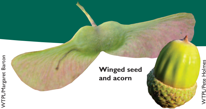
Winged seed and acorn