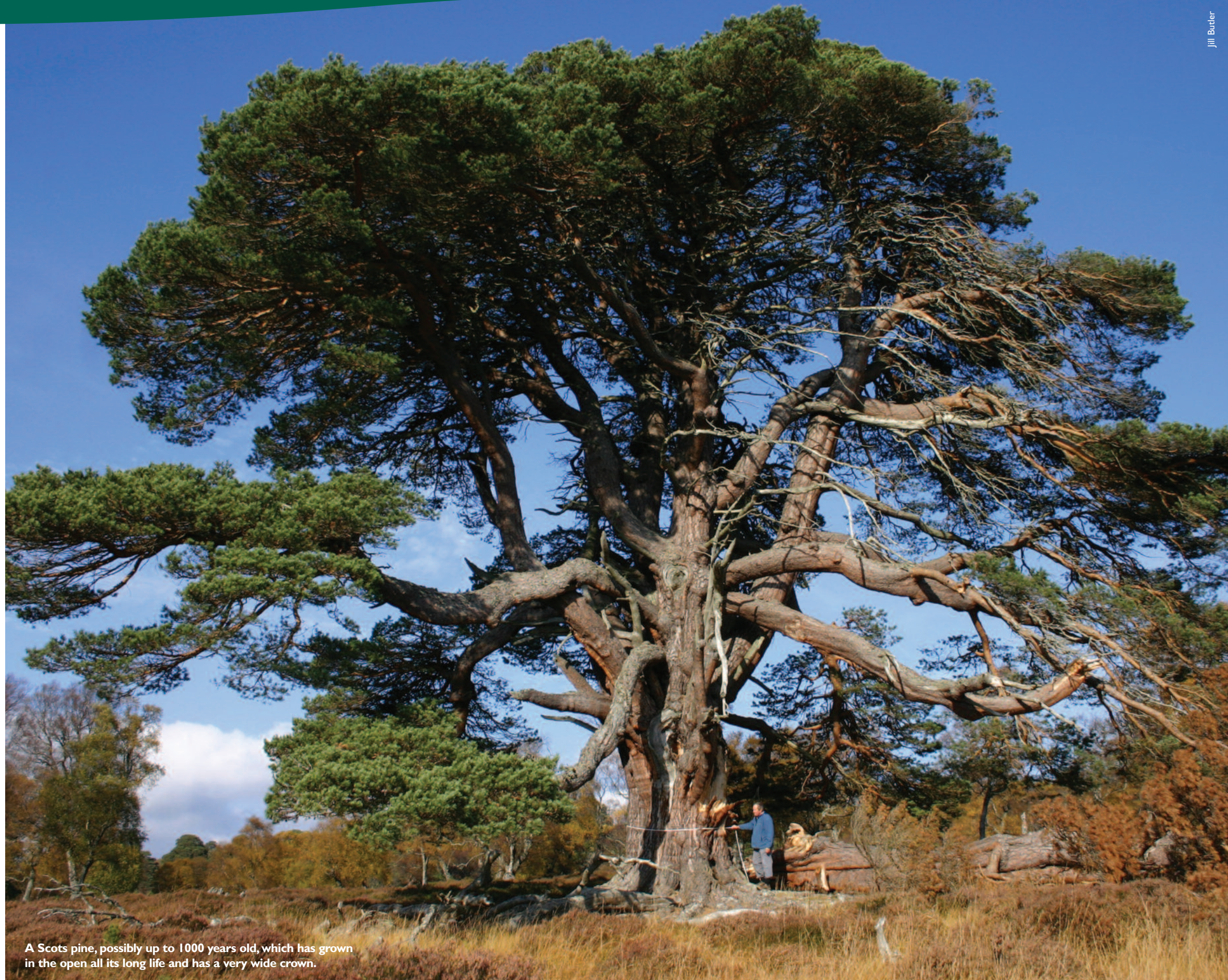
A Scots pine, possibly up to 1000 years old, which has grown in the open all its long life and has a very wide crown.

Some non-native trees, especially of European origin, can be useful in reducing the age-gap in tree populations because they grow more quickly. Sweet chestnut, which grows faster than oak has a similar heartwood and therefore some of the species associated with oak may find it a suitable alternative host.