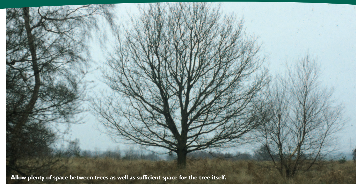
Allow plenty of space between trees as well as sufficient space for the tree itself.